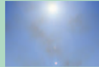
Daylight triggers the Pilkington Activ™ coating