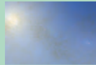
The window is exposed to daylight

Almost any exterior application, such as windows, conservatories, façades and glass roofs. It can be installed vertically or at an angle, and is especially useful for inaccessible windows where organic dirt normally collects, such as skylights. It has been designed for exterior use only.