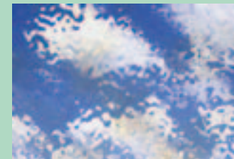
Rain water hits window and sheets down glass