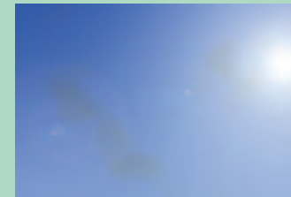
Reaction loosens organic dirt